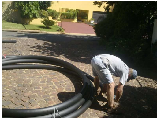
Pipe being prepared

A home owner had been having ongoing problems with a Santar sewer in Hurlingham. This line had blocked repeatedly and plumbers were eventually called in to fix it. They dug open both ends of a 22m section and found that there were more roots inside the pipe than outside the pipe! The section had to be replaced but was fairly deep and would be time consuming and expensive to replace using conventional digging. The owner also wanted it to be fixed quickly because it had been blocked for over a week and it was causing great inconvenience to him and his family – his wife in particular☺.