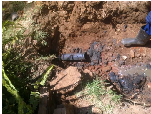
New HDPE pipe in place.

The new pipe was fed in over the wall and pulling was uneventful except the “stuff” that came out on the winch side. The old pipe was totally blocked with roots and this all got dragged out by the winch!